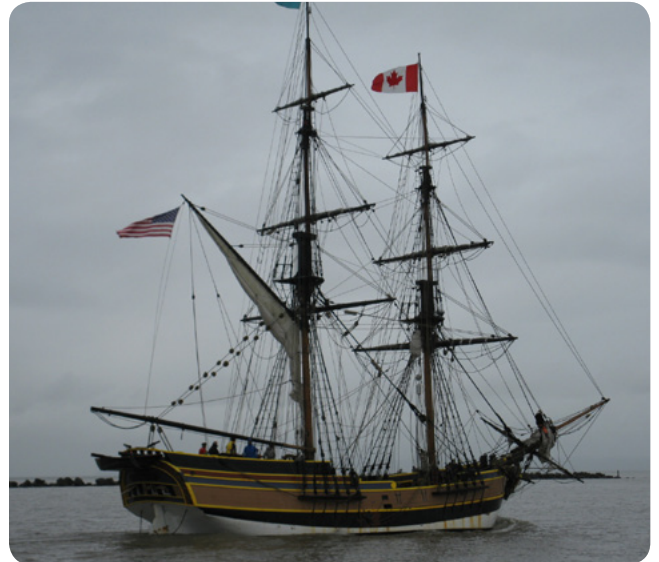
The Lady Washington sails off Garry Point in Richmond during the 2011 Ships to Shore Steveston festival.

The Lady Washington is the most famous of four North American replica sailing ships featured in the inaugural Ships to Shore festival in Steveston in early June. The Lady Washington was commissioned in Aberdeen, Washington State in 1986 and resembles an 18th century rig from Boston. Her first voyage to British Columbia was in 1991 when she visited Vancouver and Sooke. Two years later, she made her movie debut in Star Trek: Generations . Recently, the Lady Washington starred as the HMS Interceptor in the movie Pirates of the Caribbean: The Curse of the Black Pearl .