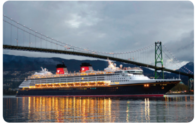
The Disney Wonder enters Burrard Inlet for the first time on May 3.

2011 Annual General Meeting: Port Metro Vancouver's 2011 Annual General Meeting will take place at 3 p.m. on June 21, 2011 at the Segal Graduate School of Business at Simon Fraser University, Room 1300, 500 Granville Street, Vancouver. Watch for the release of our first-ever sustainability report.