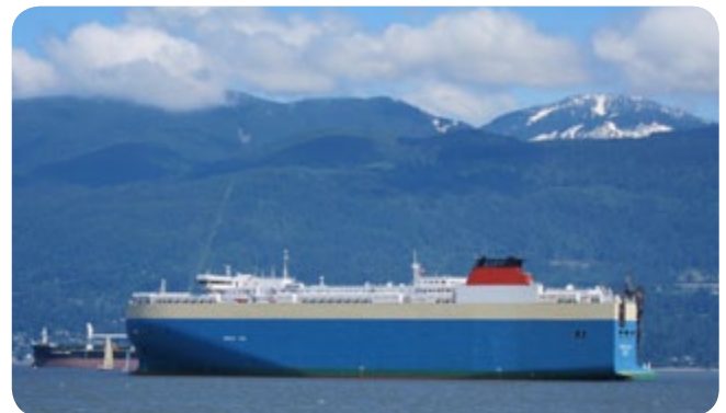
The Ro-Ro MV Violet Ace is pictured in Burrard Inlet on June 26.