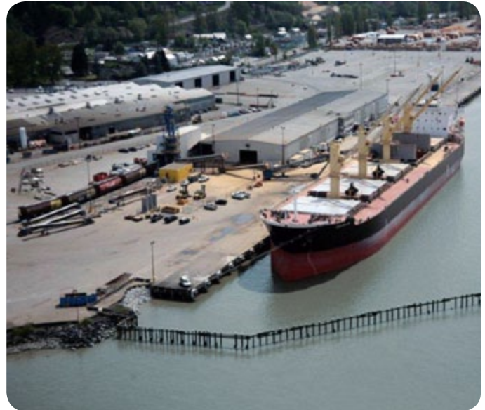
The Atalanti SB was the first bulk vessel to be loaded at the recently completed agri-bulk handling facility at Fraser Surrey Docks.

(FSD) recently opened its new agri-bulk handling facility, expanding its capability as a multi-purpose terminal by serving the fast-growing agricultural industry. The management team at the terminal was pleased with the commissioning of the new facility, as well as the successful loading of its first vessel, the Atalanti SB . Since officially opening in May, the agri-bulk facility has handled commodities such as canola meal pellets, lentils and malt. The terminal's strong intermodal rail solution, large terminal footprint and seven deep-sea berths will provide congestion-free vessel loading and discharging for ships carrying bulk cargo and for existing container and breakbulk carriers.