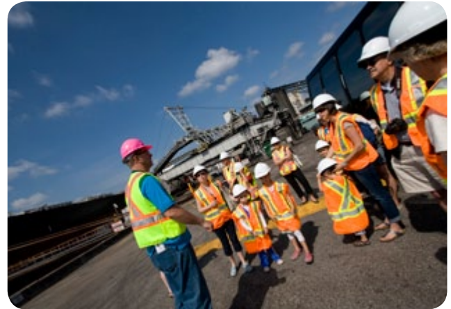
More than 400 guests attended the community open house at Neptune Bulk Terminals

house: On August 13, Neptune Bulk Terminals hosted a community open house for North Shore residents. The event provided an opportunity for the local community to visit the terminal and discover – first hand – one of North America’s largest multi-product bulk terminals. More than 400 guests attended the open house which featured site tours of Neptune’s operations, information on the company and the products they handle, a variety of children’s activities and booths from some of their community partners, including Capilano University and the Edible Garden Project .